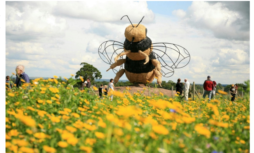
Snugburys is as famous for its ice cream as it is for its gigantic straw sculptures

By Suzanne King , TRAVEL WRITER 12 June 2021 • 3:00pm