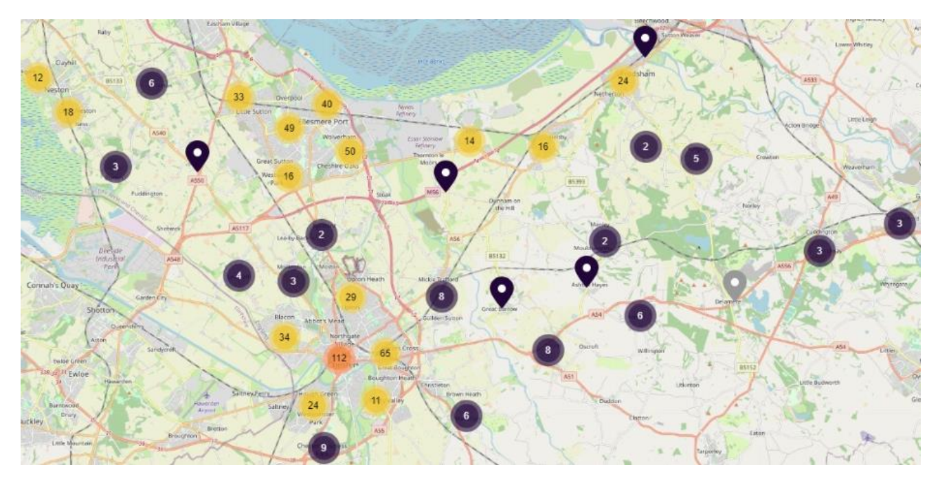
(fig 1. Top level map of all units installed )